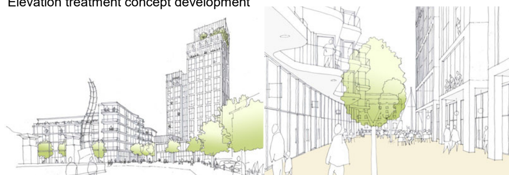
Views at street level exploring impact on streetscape