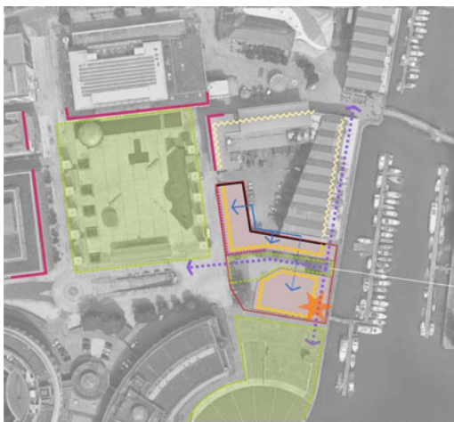
Immediate urban context