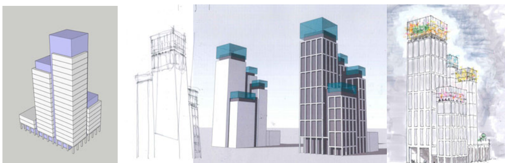
Tower concept development