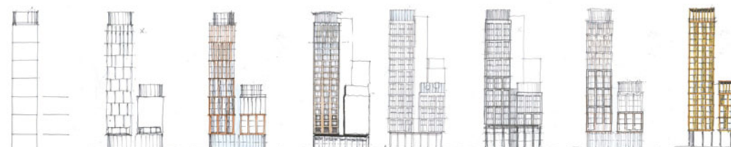
Elevation treatment concept development