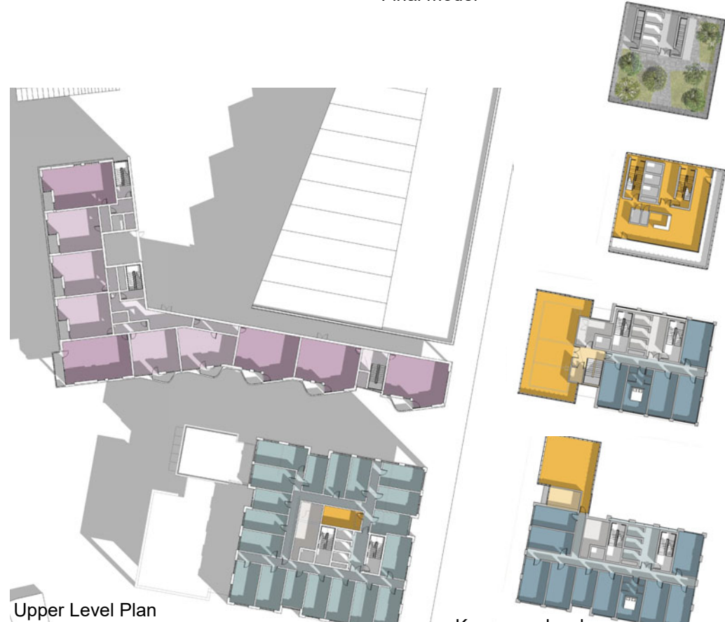
Upper Level Plan